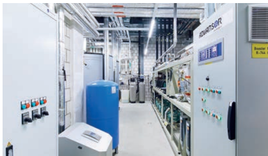
Technology and energy